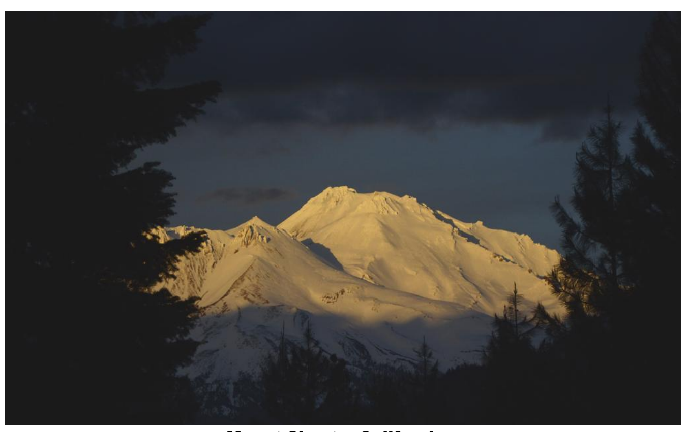
Mount Shasta, California